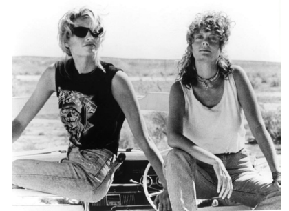
2. Thelma and Louise