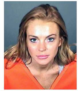
5. Celebrities and Bad Decisions