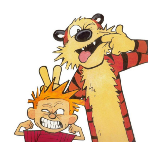
10. Calvin and Hobbes