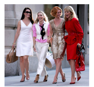
8. Sex and the City