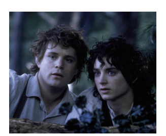
7. Frodo and Samwise